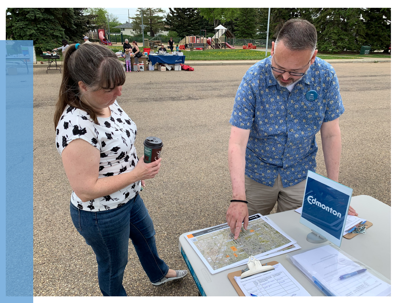
Balwin Community Garage Sale and Big Bin Event

The project team received a variety of perspectives during the mix of online/virtual and in-person public engagement activities implemented in the initial concept phase of this project. The team will be taking the information and direction provided by survey respondents and implementing it in the next phase of the concept design. Further public engagement opportunities will be provided in Fall 2022, to determine specific features for each of the five parks.