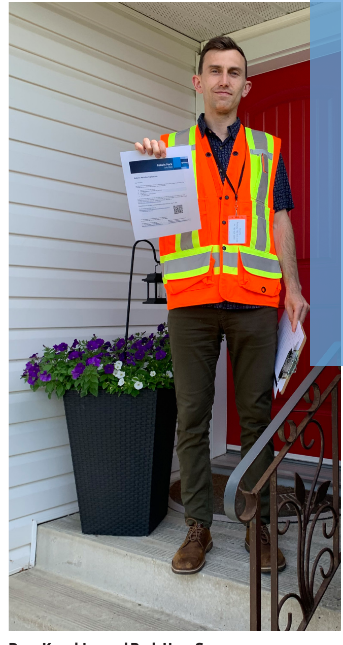
Door Knocking and Park User Surveys

A snapshot of the engagement activities the project team undertook is summarized in the following table.