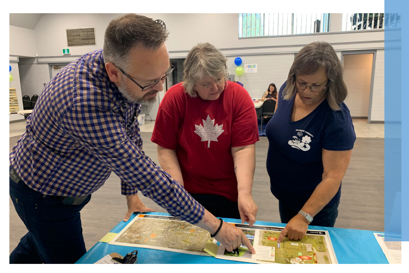
Belvedere Neighbour Day

Letter delivery, door knocking and in-person surveys focused on providing information and collecting survey responses from residents immediately adjacent to park sites and park users.