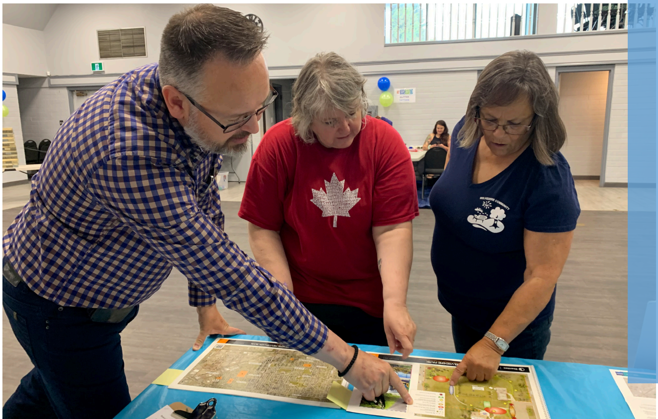
Belvedere Neighbour Day

Letter delivery, door knocking and in-person surveys focused on providing information and collecting survey responses from residents immediately adjacent to park sites and park users.