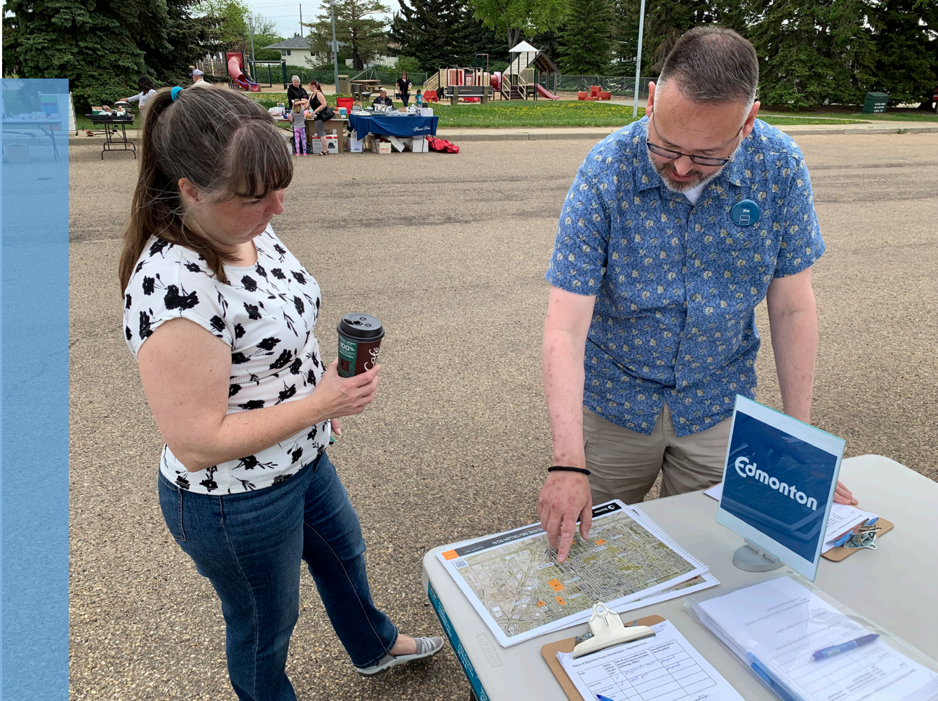
Balwin Community Garage Sale and Big Bin Event

The project team received a variety of perspectives during the mix of online/virtual and in-person public engagement activities implemented in the initial concept phase of this project. The team will be taking the information and direction provided by survey respondents and implementing it in the next phase of the concept design. Further public engagement opportunities will be provided in Fall 2022, to determine specific features for each of the five parks.