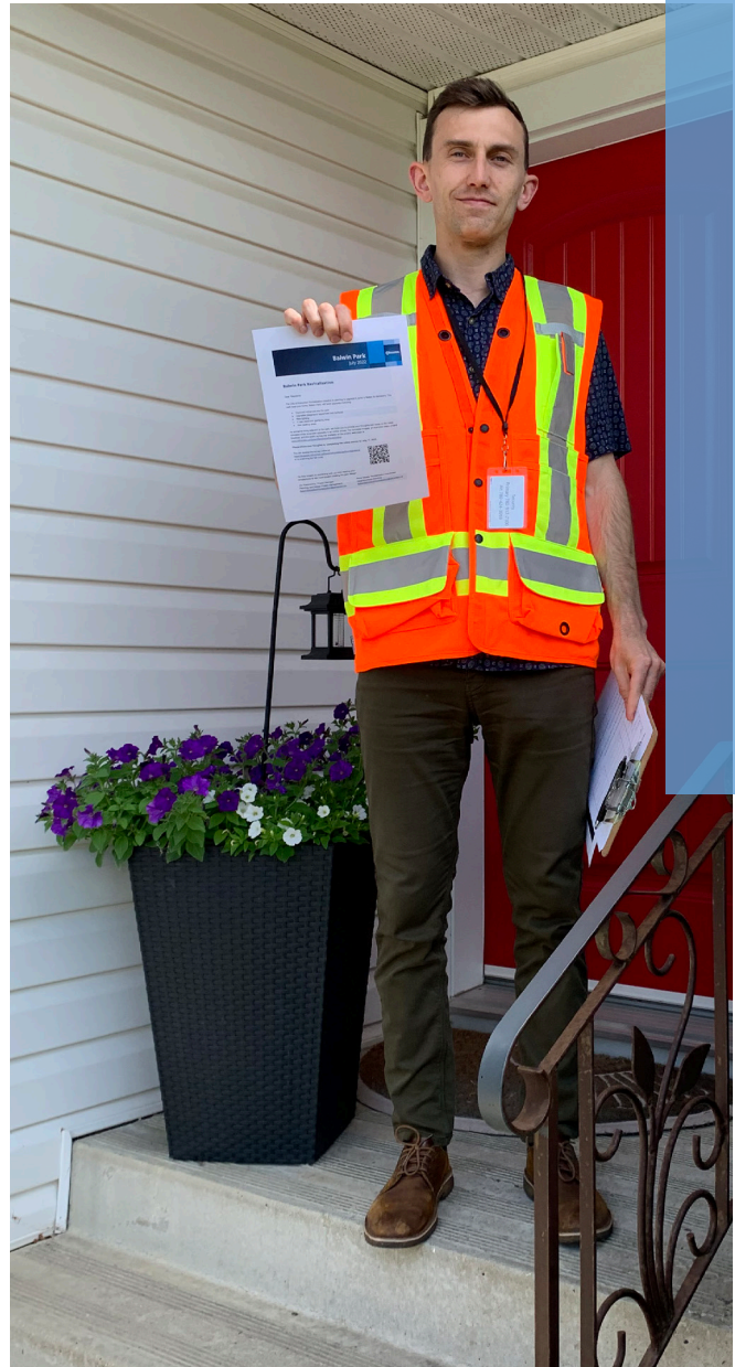
Door Knocking and Park User Surveys

A snapshot of the engagement activities the project team undertook is summarized in the following table.