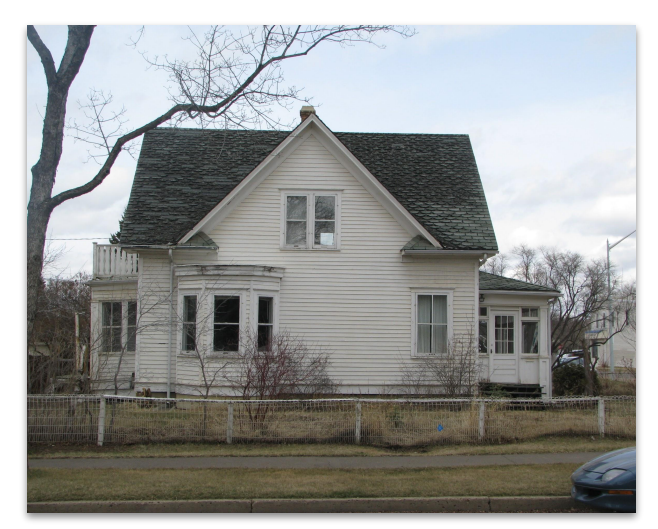
Visit edmonton.ca/historicresources to learn more

Designated as a Municipal Historic Resource through Bylaw 15252 in September 2009.