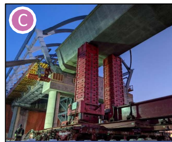
Davies Elevated Guideway Span Erection at Station Interface (TransEd)