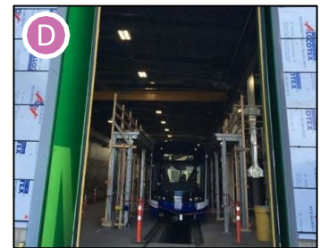
Train Doors Open to Show LRV in Maintenance Building (TransEd)