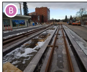
95 Ave Rail Installation (TransEd)