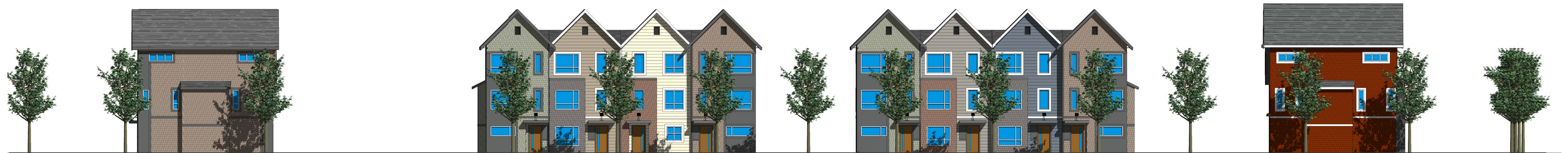
ENTRY/EXIT DRIVE WAY SITE ELEVATION ALONG EAST SIDE (112 STREET)