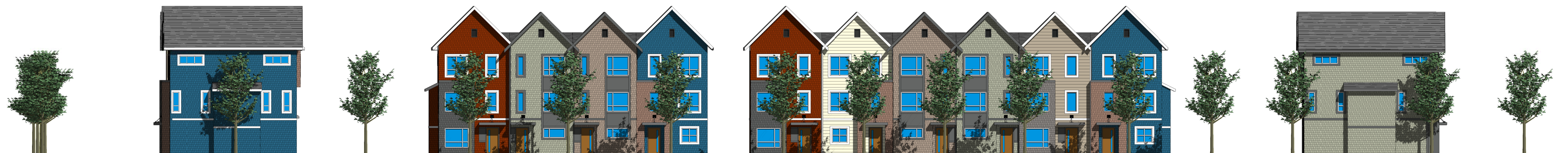
SITE ELEVATION ALONG WEST SIDE