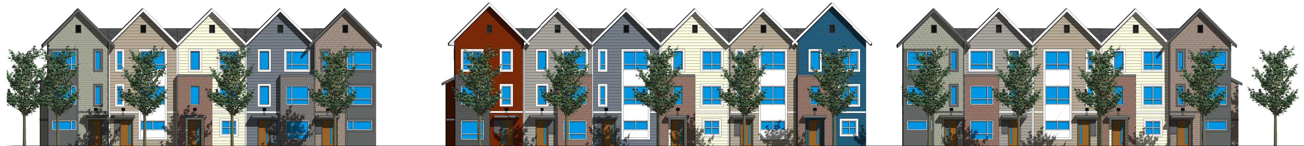
SITE ELEVATION ALONG SOUTH SIDE