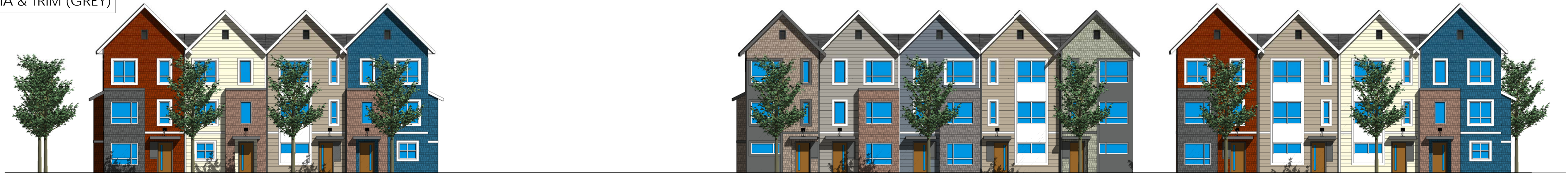
ENTRY/EXIT DRIVE WAY SITE ELEVATION ALONG NORTH SIDE (SADDLEBACK ROAD)

NOTE: 18'X32' - FASCIA & TRIM (WHITE) 16'X34' - FASCIA & TRIM (GREY)