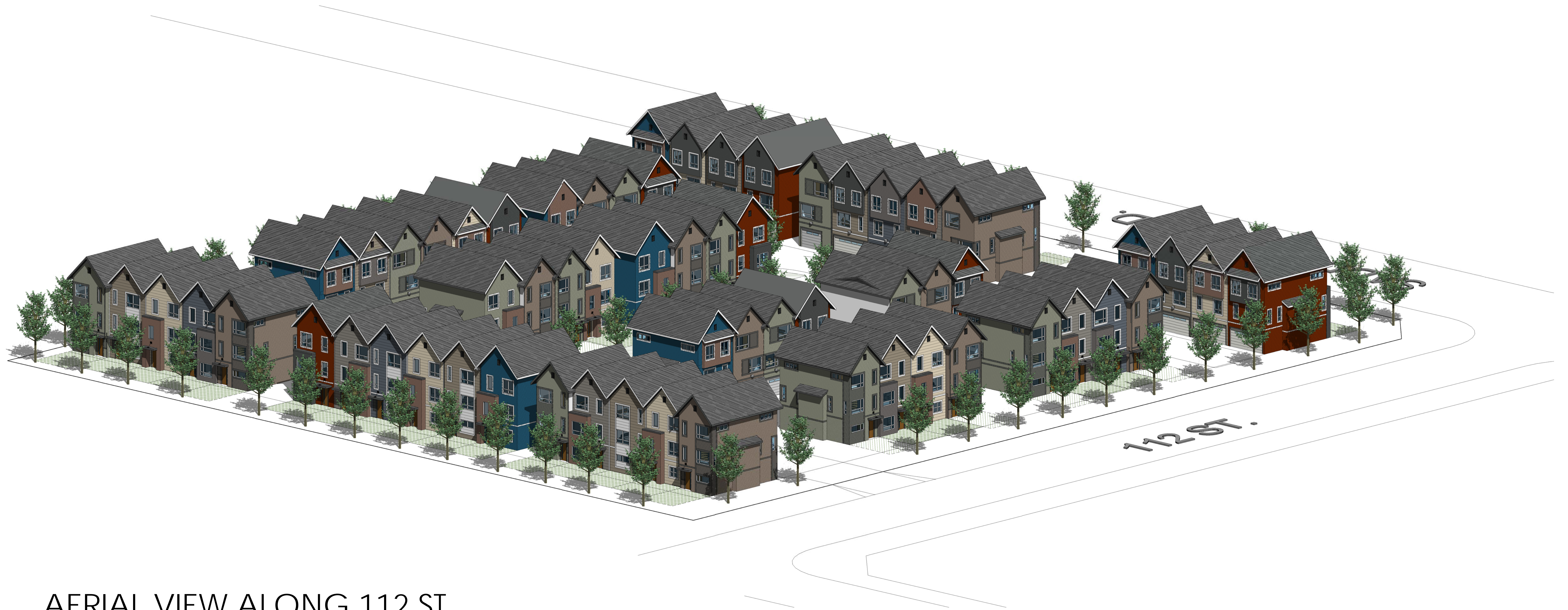
AERIAL VIEW ALONG 112 ST.