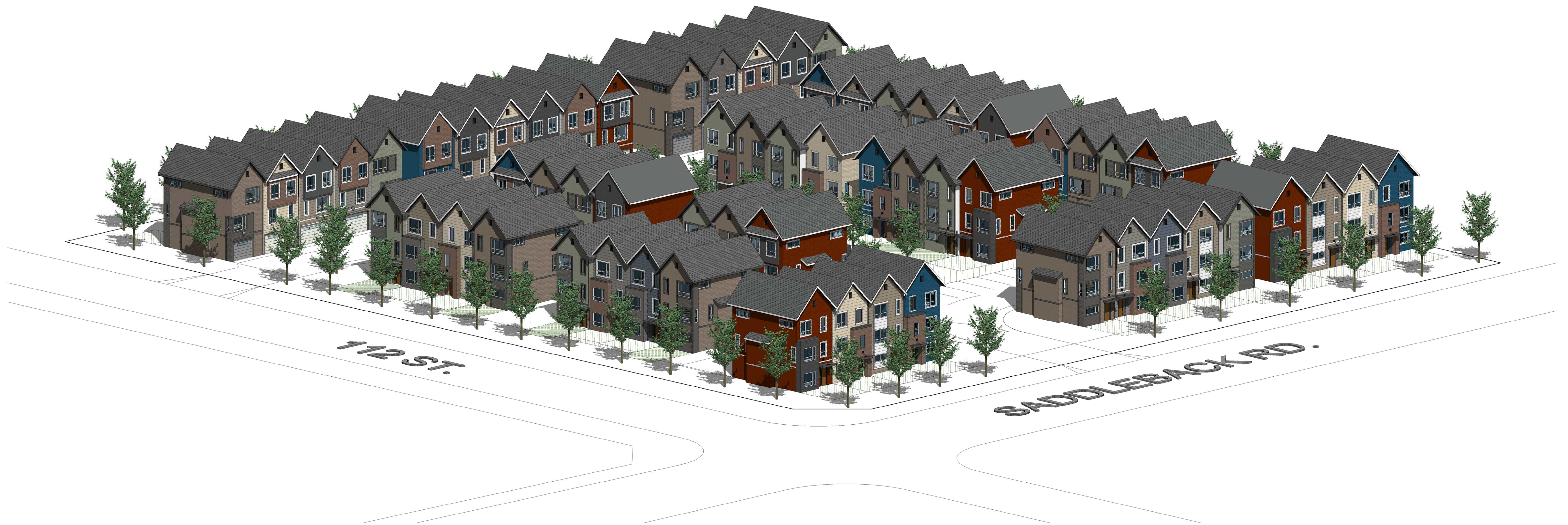
AERIAL VIEW ALONG 112 ST. & SADDLEBACK RD.