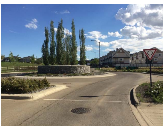
70 Street SW, Traffic Circle, Edmonton