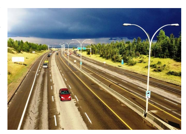
Whitemud Drive, Edmonton

concrete can be poured. Over the last four decades, Vic was involved and led countless major infrastructure projects, including Edmonton's significant thoroughfares such as Rabbit Hill Road/Anthony Henday Drive Interchange, Ellerslie Road Upgrades from 50 Street to 170 Street, 17 Street from 23 Avenue to Whitemud Drive, to name a few. These routes are used by thousands of commuters each day, where safety and efficiency are the highest priority. Victor has overseen these projects with vision and the foresight to identify potential conflicts and rectify them before they are constructed on a massive scale.