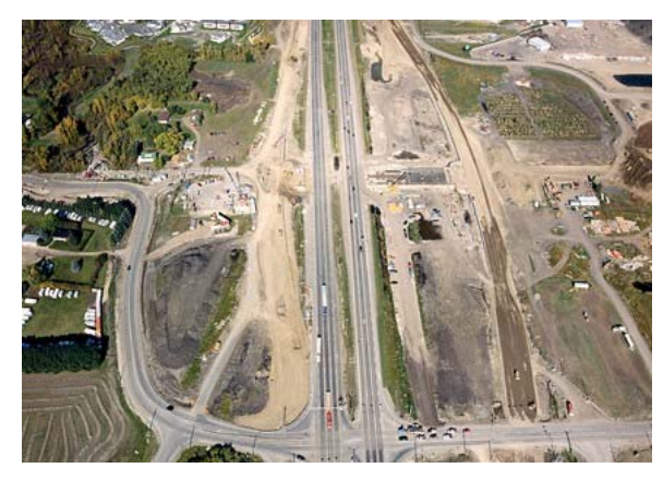
Ellerslie Road SW Upgrades, Edmonton

Urban dwellers are mainly unaware of the countless hours of meticulous design needed from the conceptual stage, progressing through preliminary design, and detailed design before construction can begin and