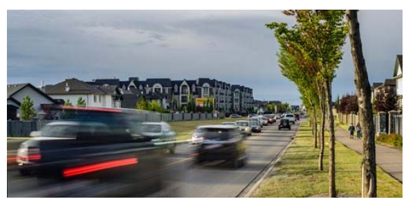
Rabbit Hill Road SW, Edmonton

His knowledge is one of the most comprehensive understandings of the transportation system within the City of Edmonton. This depth of experience kept a constant