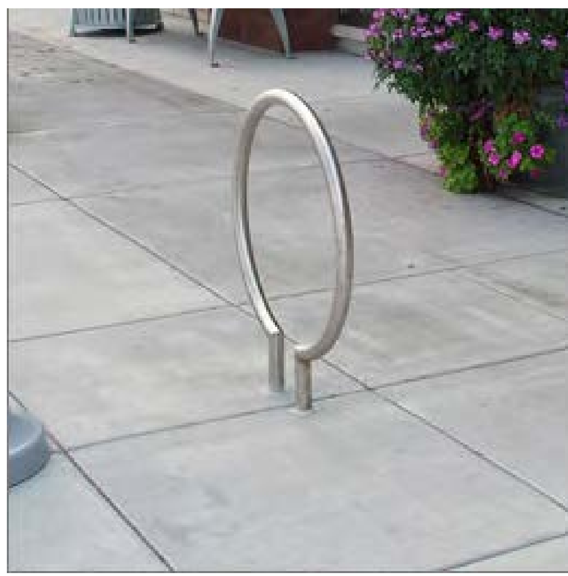
Bike Racks Consistent with Jasper Avenue New Vision to provide visual continuity and simplify maintenance and/or replacement in the future.