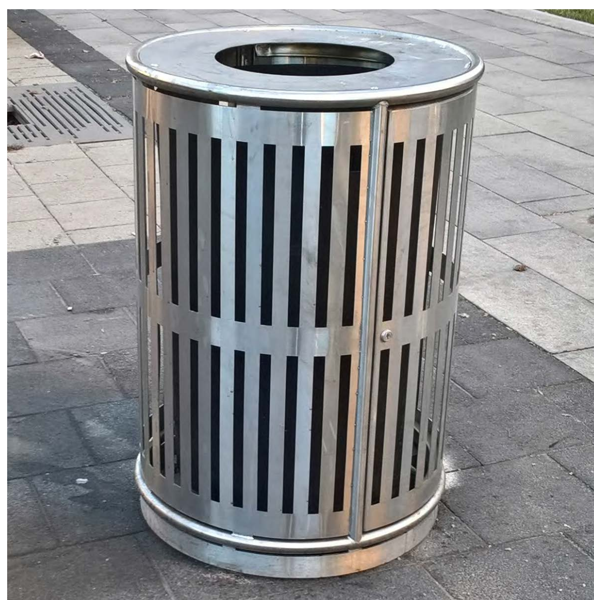
Waste Receptacles Consistent with Jasper Avenue New Vision, with top access, to provide visual continuity and simplify maintenance and/or replacement in the future.