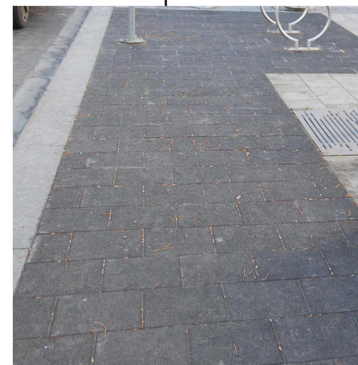
High-Contrast Furnishing Zone Surface Contrasting colour of paving in furnishing zone improves wayfinding and clarity for the visually impaired. Intent it to use dark colour concrete paving stones, similar to Jasper Avenue New Vision.