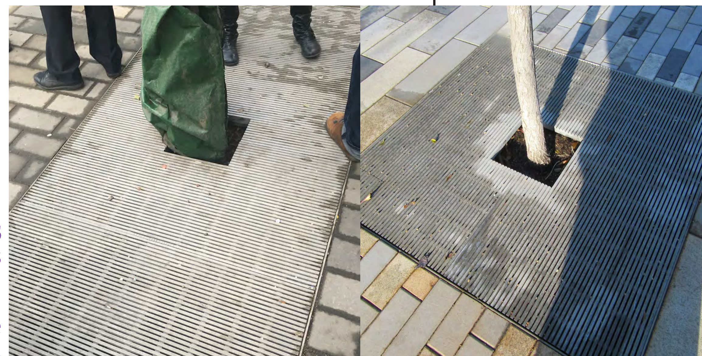
Tree Grates Contemporary grate conforms to accessibility guidelines. Used in other locations in Edmonton which simplifies maintenance and/or replacement in the future.