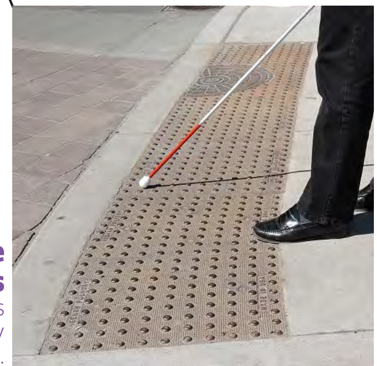
Tactile Walking Surface Indicators Used at bus stops and intersections to improve safety for the visually impaired.