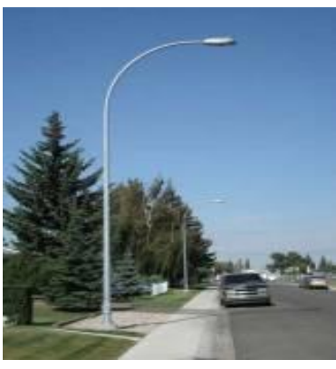
Standard galvanized street light

If you are a property owner in the community and have not yet completed an Expression of Interest form, please submit the form by November 20.