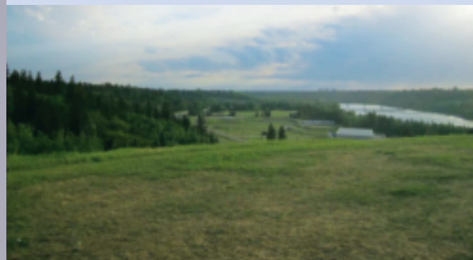
Dog off-leash area in Belgravia