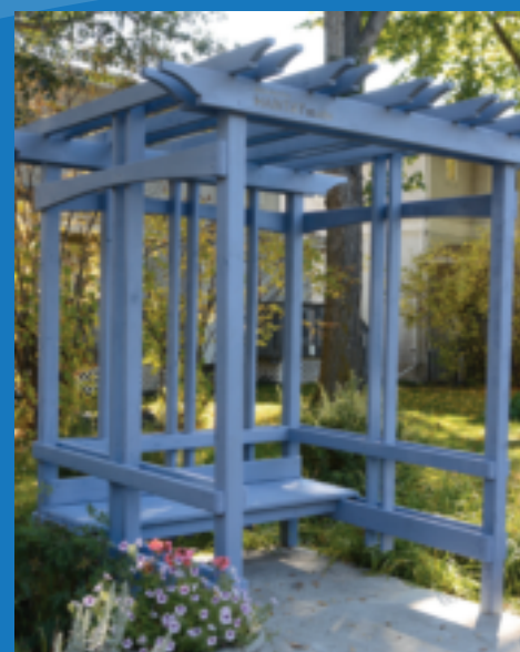
Pocket Park in McKernan