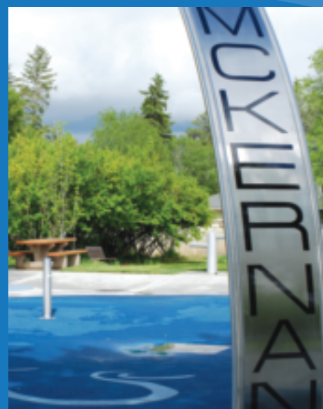
McKernan Spray Park