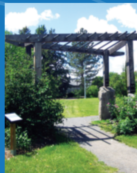
Belgravia Art Park Arbour