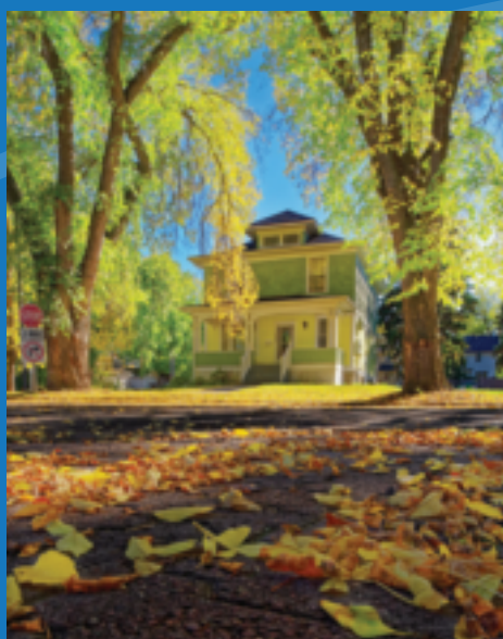
Autumn on Campus

Garneau, Windsor Park, Belgravia and McKernan four vibrant communities that put you in the centre of Edmonton and are perfect for those choosing an active lifestyle in a vibrant area.