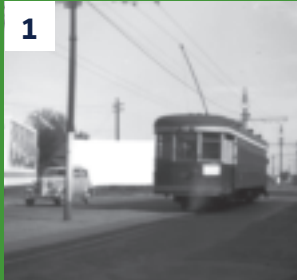
1 124 th Street was one of the original Streetcar routes that connected the growing community with downtown