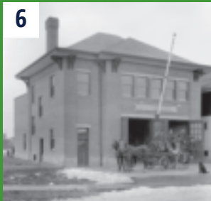
6 Former Firehall # 8 10986-126th St. Served the surrounding area for over 50 years