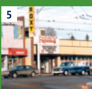
5 Originally built in 1938 and destroyed by fire in 2015, the Roxy will soon be reborn