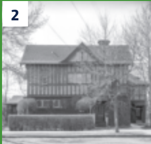
2 The Tudor mansion built in 1911 by the legendary Peace River Jim