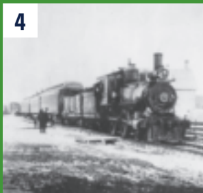
4 The Edmonton Yukon and Pacific railway used to run right through Westmount