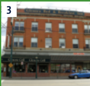
3 Once a landmark of the neighbourhood, being reborn as the MaLauren