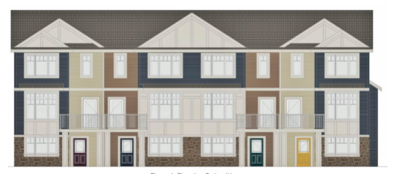
Figure 4: Elevation Option #1

Following discussion and recommendation from the last meeting, the builder share two distinct elevation (figure 4 and figure 5) under craftsman style. The elevation is influenced by the surrounding homes architecture to ensure they "fit" in the neighbourhood. Participants preferred second option (figure 5). Landmark will retain an external constant to use neighbourhood design elements and provide photo realistic rendering. The final rendering will be shared once completed.