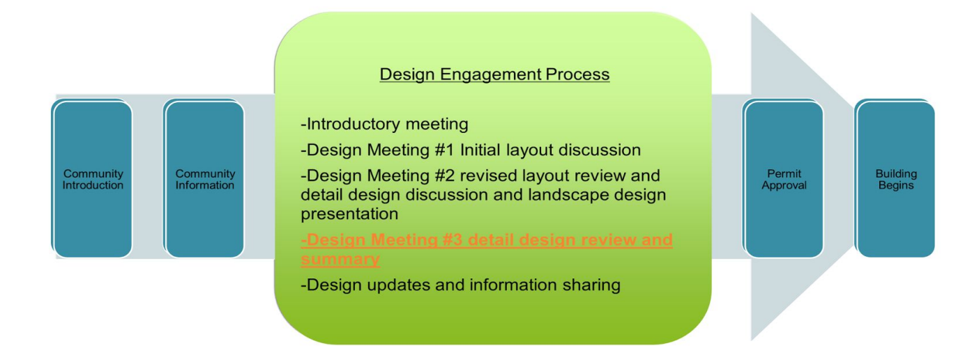
Figure 1: Design Engagement Process

May 25, 2017 design engagement notes reviewed and accepted as presented