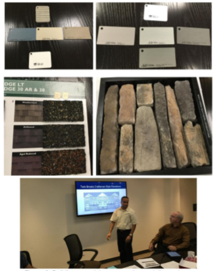
Figure 6: Building materials presentation and discussion

Builder also explained exterior material and suggested their inspiration from the surrounding,