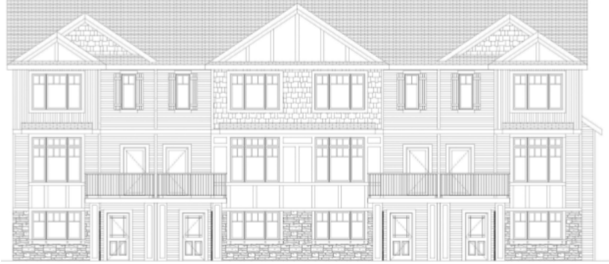
Figure 5: Elevation Option# 2