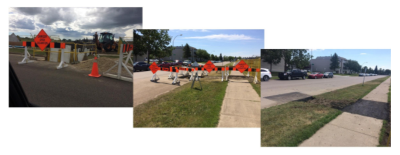
Figure 2: Site servicing connection work

Builder explained process and steps for site servicing related to power, water, drainage connection to the First Place site in Twin Brooks. All of these services are provided by the respective third party service provider. Landmark will coordinate with them to ensure both safety and access throughout the construction process. Servicing connection work takes between two and three weeks, depending on the complexity.