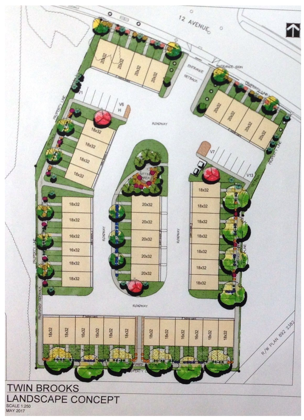
Figure 7: Final Site Landscaping Plan