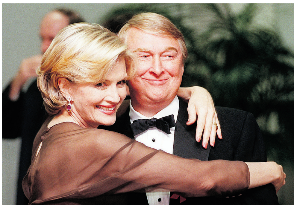
Legendary director and producer Mike Nichols was married to news anchor Diane Sawyer.

Nichols is one of only a handful of those known as EGOT winners — with Emmy, Grammy, Oscar and Tony awards to their names.