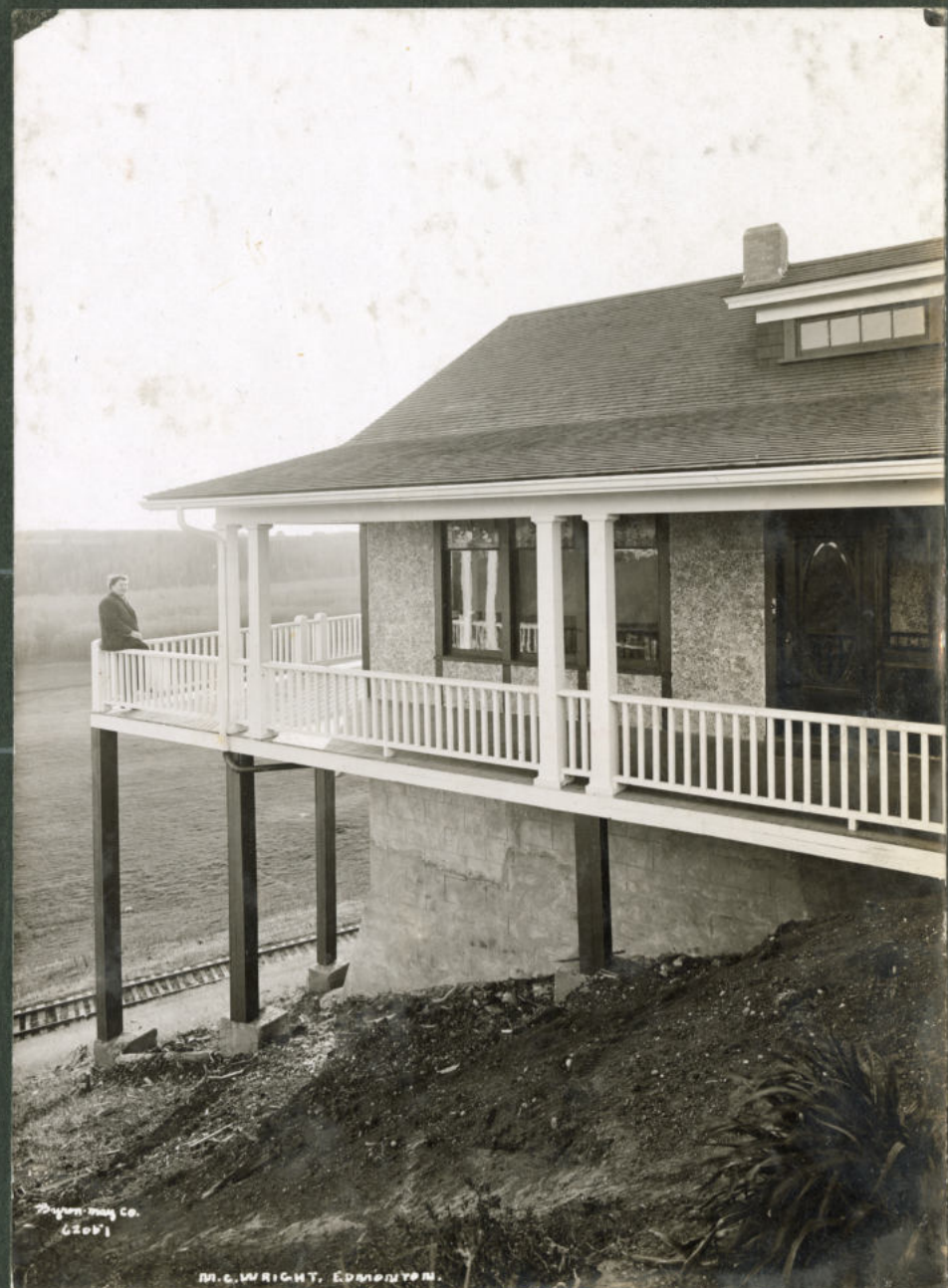
Reynolds Co. 62-071