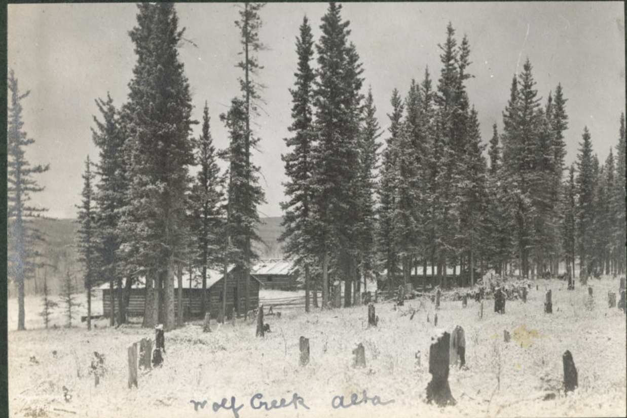
Wolf Creek Alta