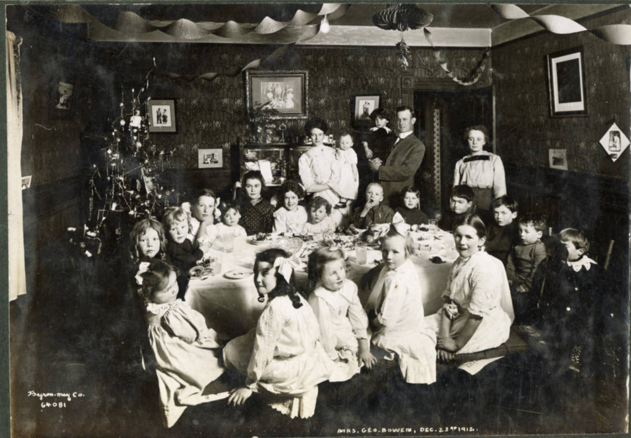
Reynolds Co. 64-081