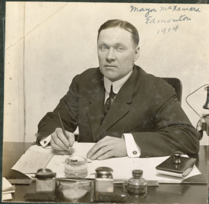
Mayor McTamara Edmonton 1914