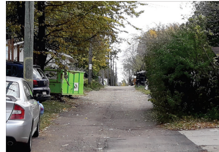
Vertical clearance issues and potential hedge or shrub removal