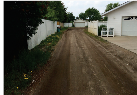
Before alley renewal