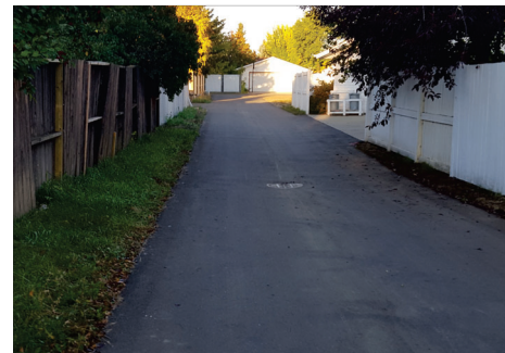
After alley renewal