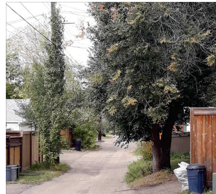
Vertical clearance issues and potential tree removal