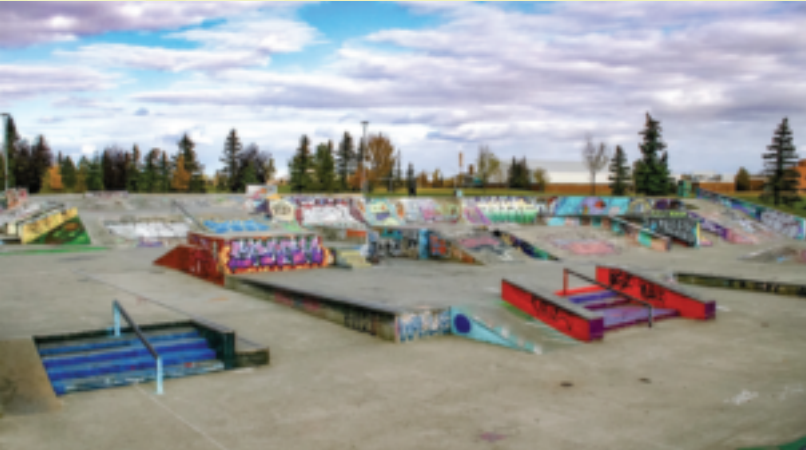
Castle Downs Skate Park