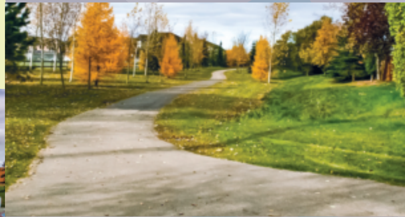
Pathways in Carlisle

Edmonton has over 40 locations where you can enjoy your walk while your dog is off-leash. Please remember that all sites where dogs are permitted to be off-leash are multi-use areas used by all. Your dog must be leashed when not in a designated off-leash area. The dog icons show on this map are placed in the approximate location of each off-leash area, but do not show the precise boundaries. For more information, including details on off-leash boundaries, check the Parks for Paws Brochure or go to edmonton.ca (keyword off-leash)