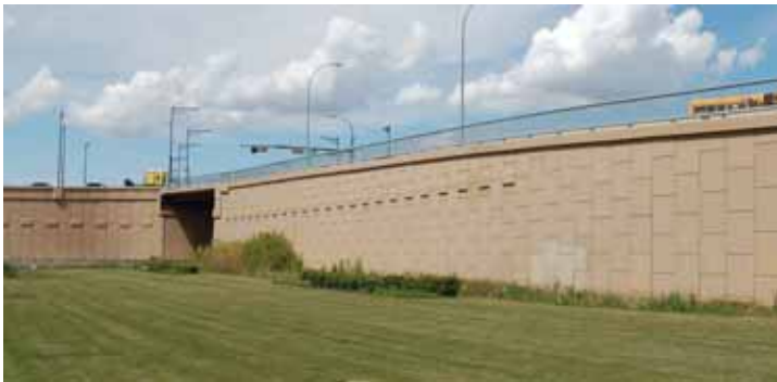
23 Avenue and Gateway Boulevard