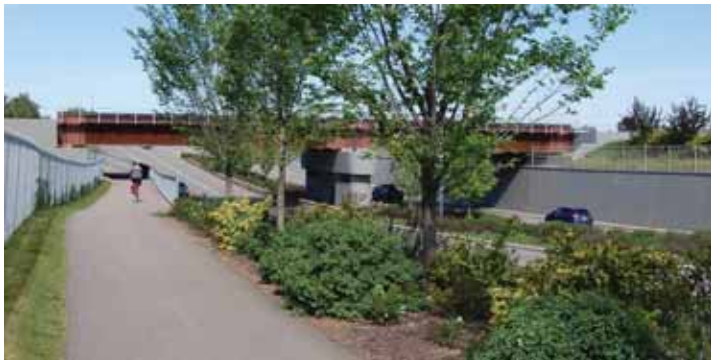
Shared use path feature