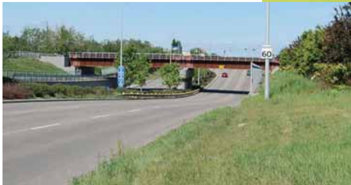
137 Avenue and 142 Street