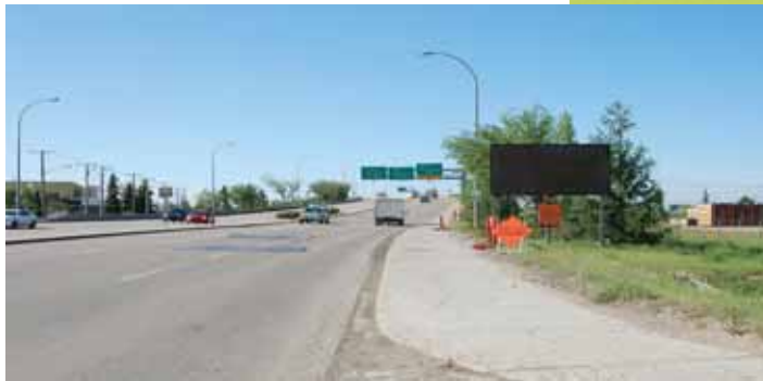
156 Street and Yellowhead Trail