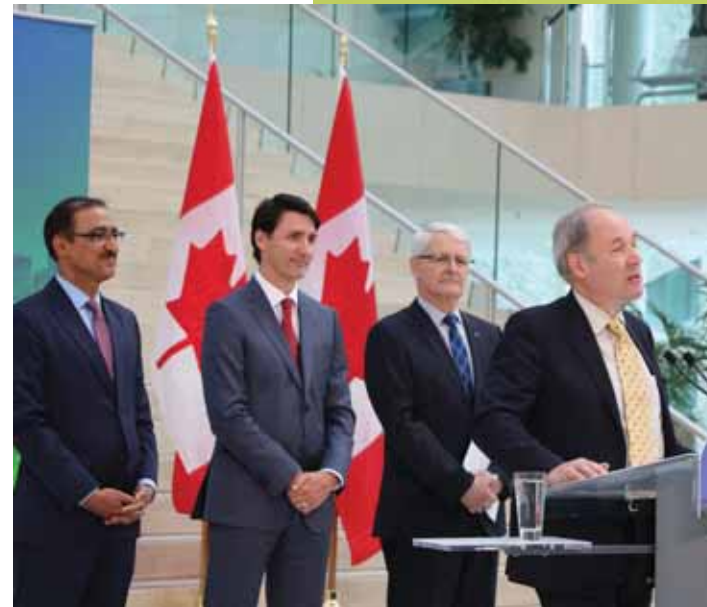
(l-r) The Honourable Amarjeet Sohi, Minister of Infrastructure and Communities, The Right Honourable Justin Trudeau, Prime Minister of Canada, The Honourable Marc Garneau, Minister of Transport, and Councillor Ben Henderson, Councillor for Ward 8.

If funding is approved, construction would coincide with the railway grade separation work.