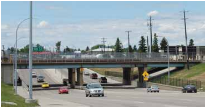
63 Avenue and Gateway Boulevard