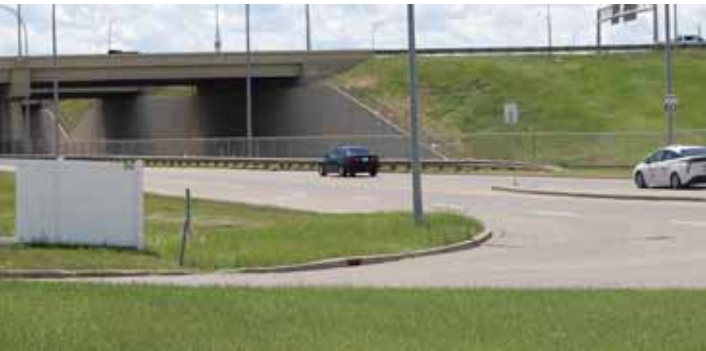
Anthony Henday Drive and Parsons Road