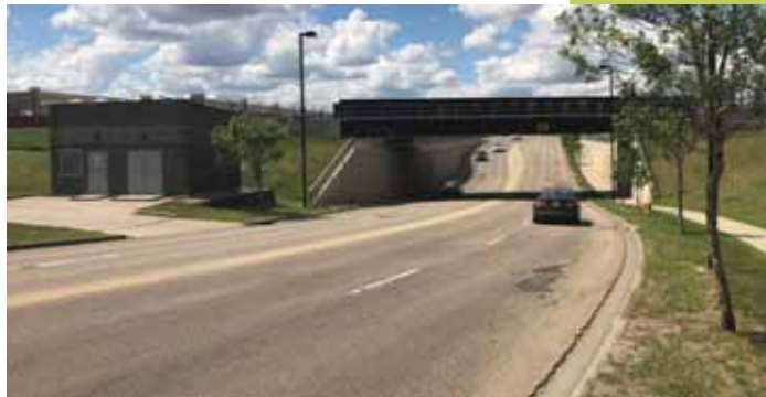
13 Avenue and Parsons Road