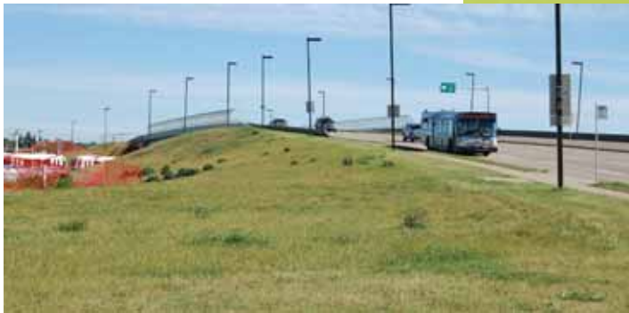
50 Street and Manning Drive