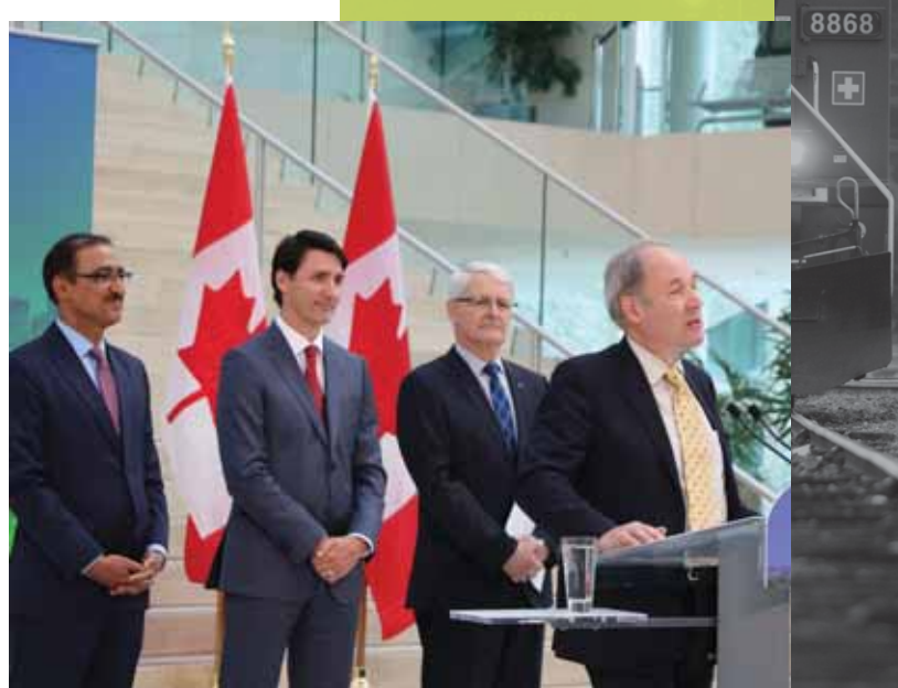
(I-r) The Honourable Amarjeet Sohi, Minister of Infrastructure and Communities, The Right Honourable Justin Trudeau, Prime Minister of Canada, The Honourable Marc Garneau, Minister of Transport, and Councillor Ben Henderson, Councillor for Ward 8.

If funding is approved, construction would coincide with the railway grade separation work.