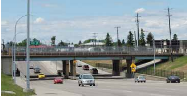
63 Avenue and Gateway Boulevard