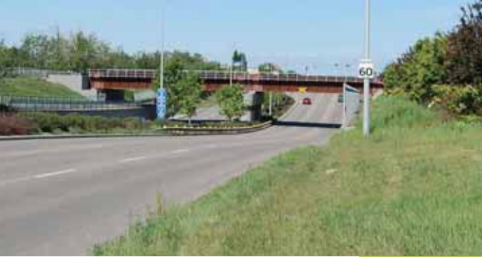
137 Avenue and 142 Street