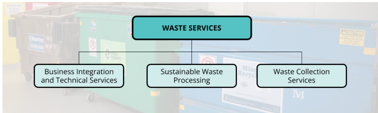
Figure 2.1: Waste Services Utility Organizational Structure

The organizational structure of Waste Services is fully aligned to the Corporate Business Plan and consists of three sections (Figure 2.1).