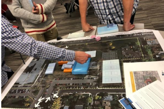
Participants gathered around the modelling table at the Drop-in Public Open House