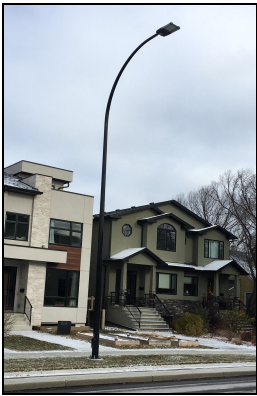
Powder coated galvanized