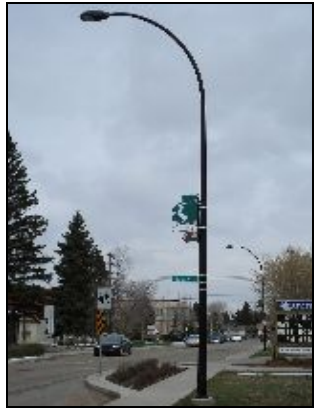
Powder coated galvanized