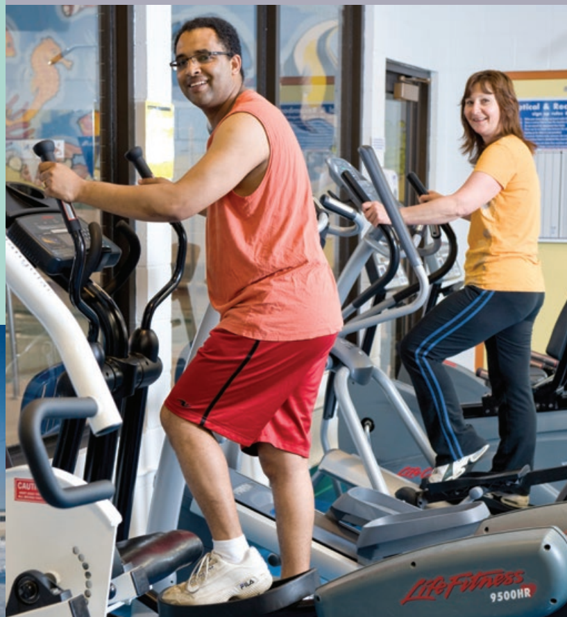
Jasper Place Fitness and Leisure Centre

There are 1,440 minutes in a day, schedule 30 of them for walking!