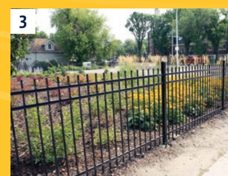
3 The Garden of Truth is a community garden to honour and commemorate Indigenous history in Edmonton.