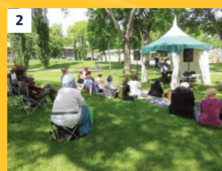
2 Heart of the City Music and Arts Festival, a free, family-friendly music and arts festival in the heart of Edmonton that promotes and supports original, local and emerging artists.