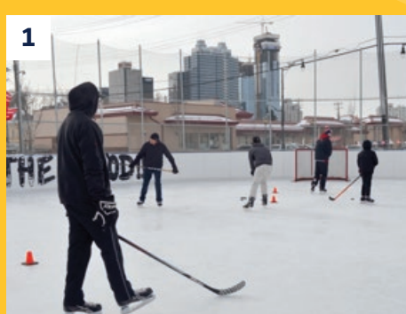
1 Family Day 2018 at the McCauley Rink