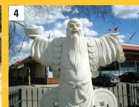
4 Buddha Statue located at 97 Street & 107 A Avenue