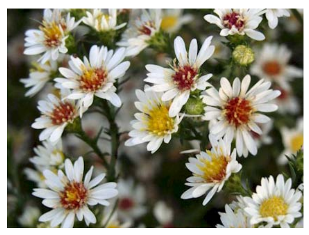
Above image: Heath aster.

Aster flowers grace most regions and habitats across Canada, thriving in areas with cool and moist summers. They are commonly seen in fields and on roadsides, and they brighten fall gardens while little else is blooming.