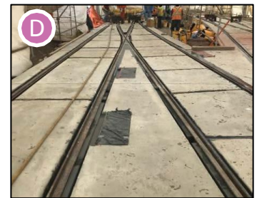
Embedded Special Track Installation at 28 Ave (TransEd)