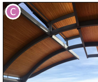
Davies Station Timber Roof Installation (TransEd)