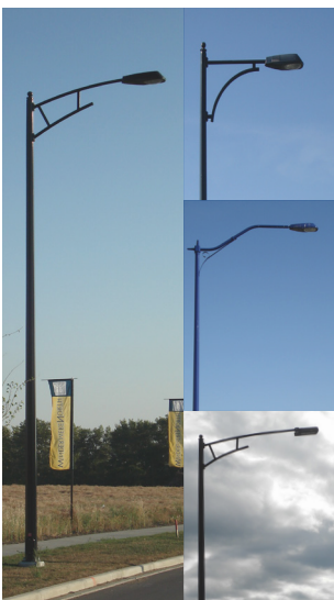
Decorative street lights (cost-shared with 124 Street property owners)