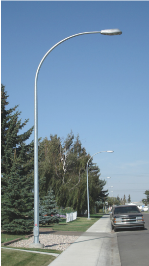
Standard galvanized street lights (included in the budget for 124 Street renewal)

There are two types of lighting options for the 124 Street Renewal: decorative street lights and secondary lighting .