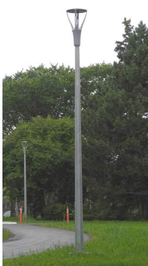
Pedestrian light (cost-shared with 124 Street property owners)