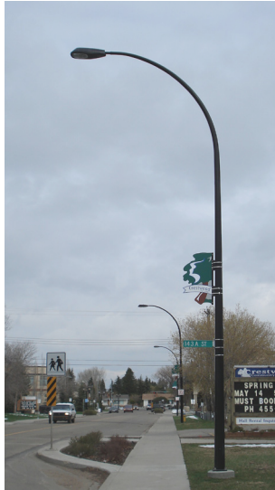
Powder coated galvanized street lights (cost-shared with 124 Street property owners)