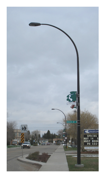
Powder coated galvanized street lights (cost-shared with 124 Street property owners)