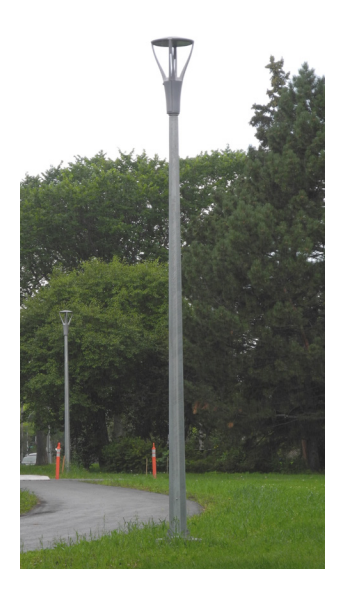
Pedestrian light (cost-shared with 124 Street property owners)