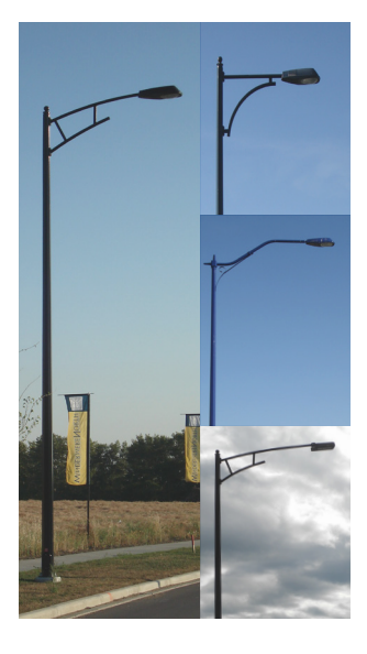
Decorative street lights (cost-shared with 124 Street property owners)