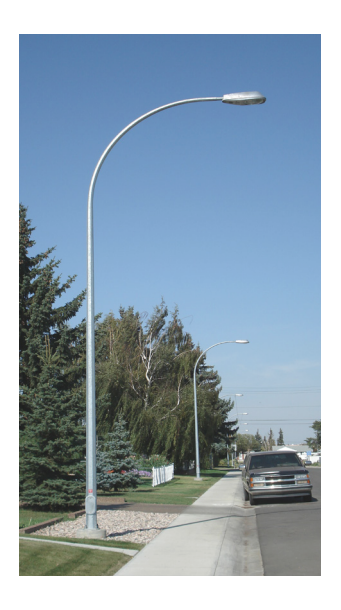
Standard galvanized street lights (included in the budget for 124 Street renewal)

There are two types of lighting options for the 124 Street Renewal: decorative street lights and secondary lighting.