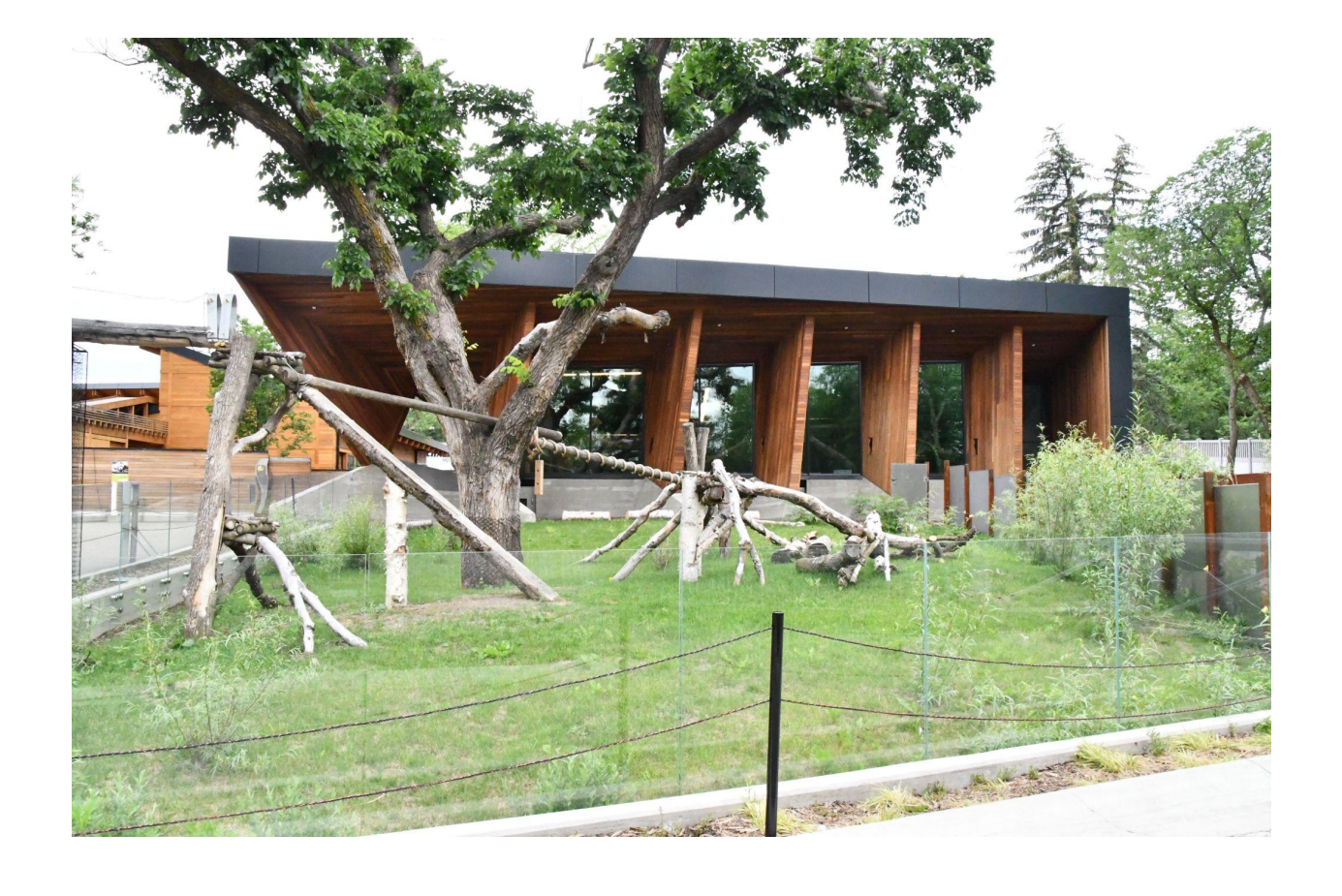
I may see red pandas in their exhibit. They may be on the ground or high up in the trees.