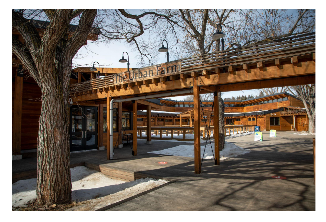
I will know I have arrived at the Urban Farm when I see a long wooden building.