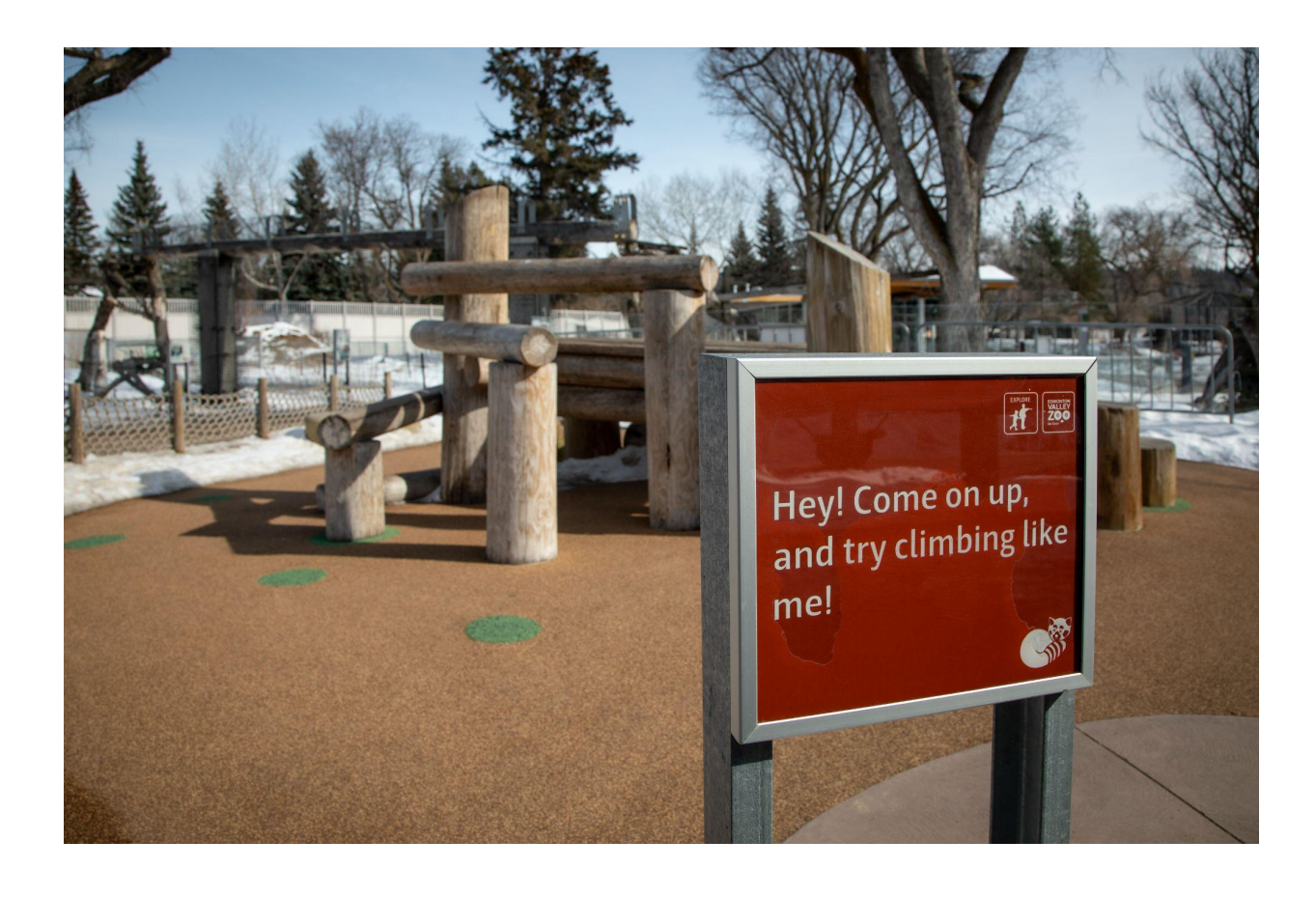
I can play here in the red panda play area if I want to.