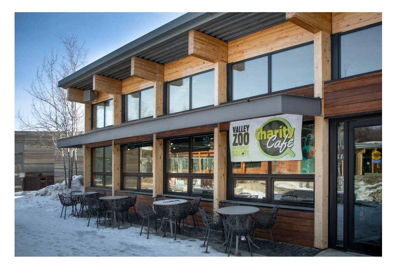
I can buy food at the Plaza Cafe if I want to. I can sit inside the cafe or outside.