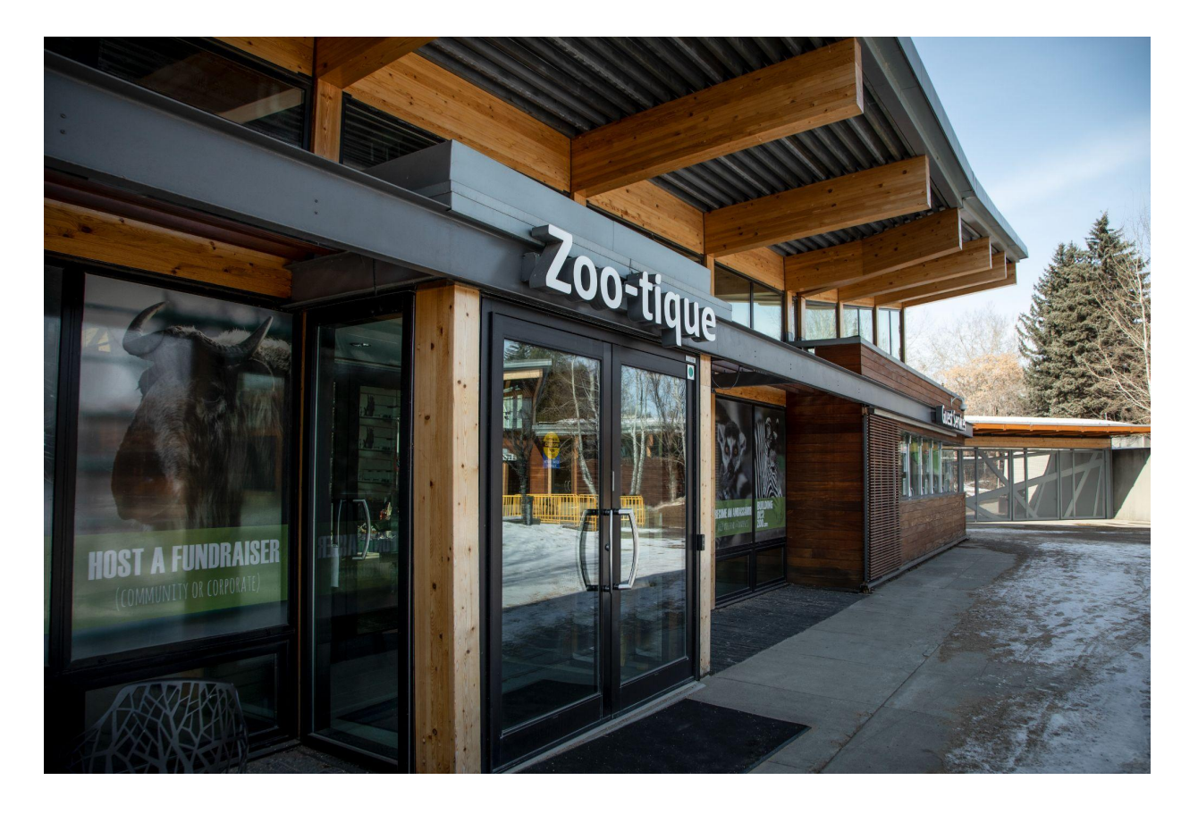
The gift shop at the Zoo is called the Zootique. You can visit the gift shop to buy a souvenir if you want to.