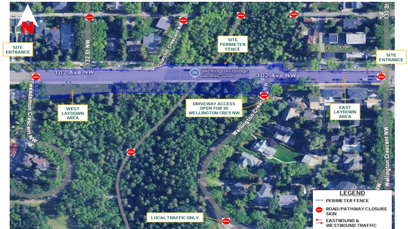
Image 1 (above) - Construction Map | Image 2 (below) - Pedestrian/Cyclist Detour Map