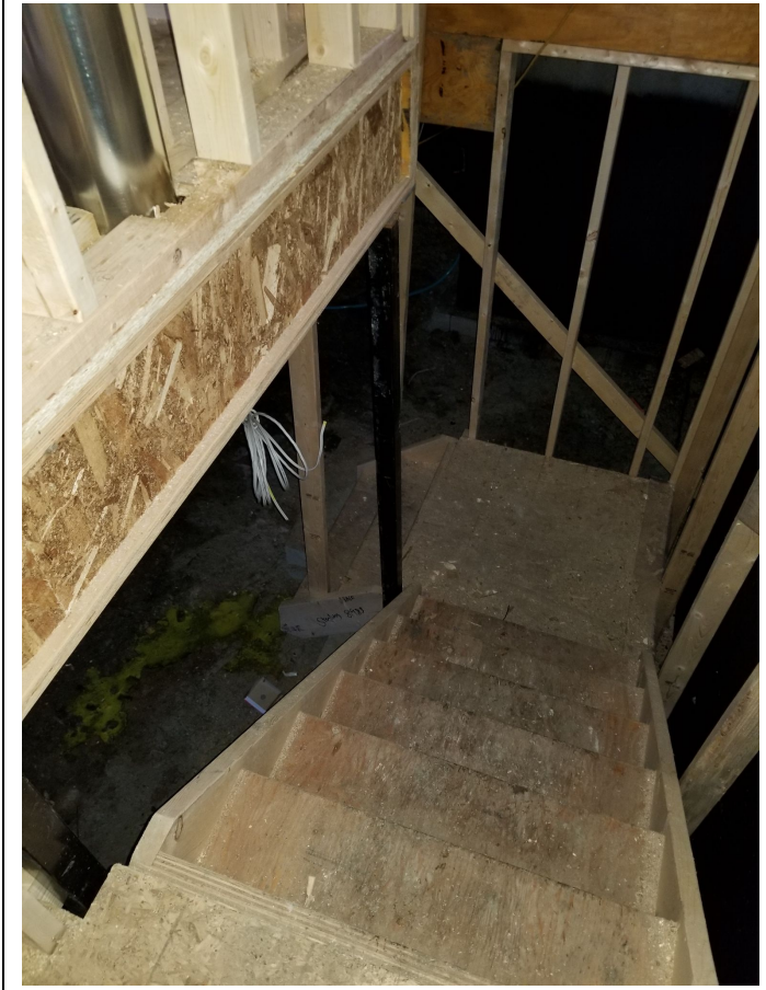
3 point contact is provided