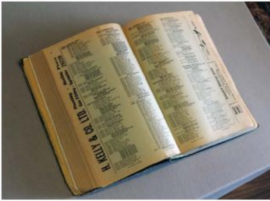
A Henderson's Directory on display.