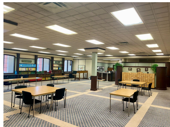
Reference Room at the City of Edmonton Archives.

It's a good idea early in the process to ask neighbours what they know about the history of the property. They may also know of long-term residents in the area who may remember former owners or tenants of the property. You can also check with the community association to see if a local history has been written, which may contain information on former residents. Finally, consider putting a notice in a community newsletter asking people with knowledge of local lore to contact you.