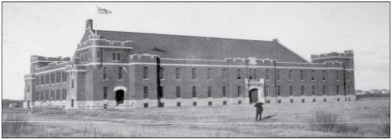
A man stands in front of the Prince of Wales Armouries ca. 1915 in one of the Archives' earliest photos of the building.