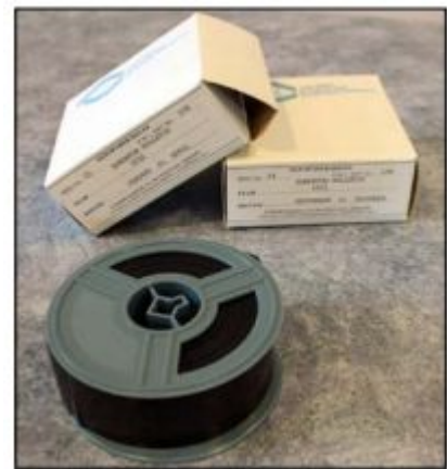
The Edmonton Archives has an extensive microfilm collection.