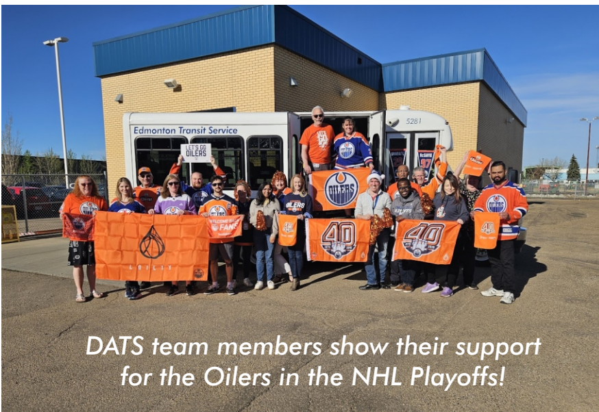
DATS team members show their support for the Oilers in the NHL Playoffs!

NOTE: Do you know of any upcoming events that DATS may like to participate in? We would love to hear more about it! Contact our team at (780) 496-4567 (option 4) or email DATS@edmonton.ca