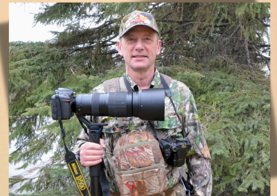
or Whitemud Wayne , defender of the regal Blue Jay!

Audience members are encouraged to come ready for fun and dress up in the colours of their favorite bird.