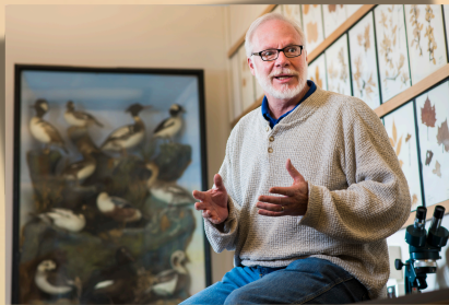
The Nature Nut who is speaking up for the gentle and shy Boreal Chickadee,