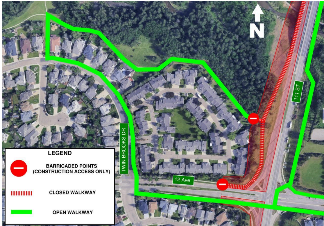
Map 2: Blackmud Creek Shared-Use Path Detour (currently in effect)