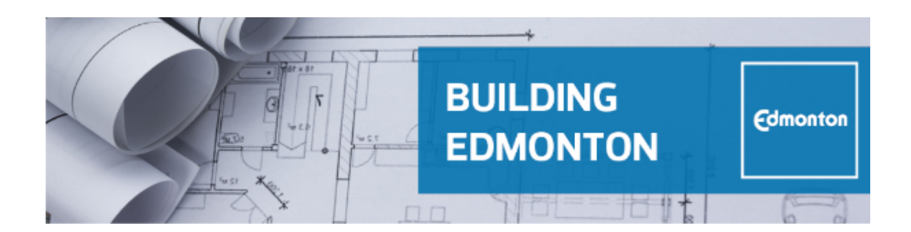
Register for the September Building Blocks Session

This issue of Building Edmonton has been sent on September 13, 2022.