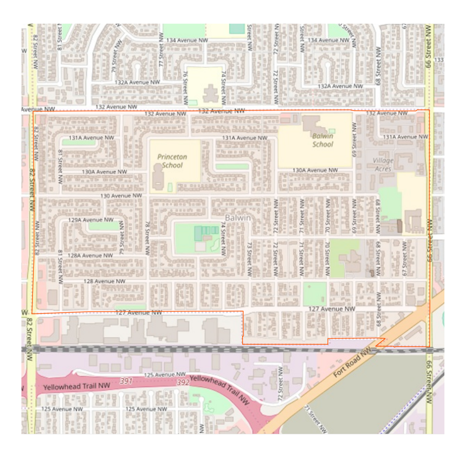
Prepared By: UFCSD | City Planning | Urban Analysis | Research & Analysis

Balwin is located immediately to the west of Belvedere. Roughly rectangular in shape, it stretches from 66 Street to 82 Street, and from 132 Avenue southwards to 127 Avenue. Although the proportion of its working age population is lower than Edmonton's average, Balwin has higher proportions of seniors and children (i.e., aged 14 and under) compared to other communities.