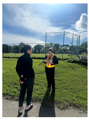
The public was informed of the engagement opportunity through postcards delivered to postal codes surrounding Allin Park. The postcard informed recipients about the project, the opportunity to complete the online survey and to learn more about the project at edmonton.ca/PlaygroundRenewal.

This first engagement period occurred from June 10 to 23, 2024.