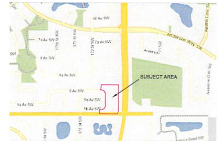
KEY PLAN NOT TO SCALE