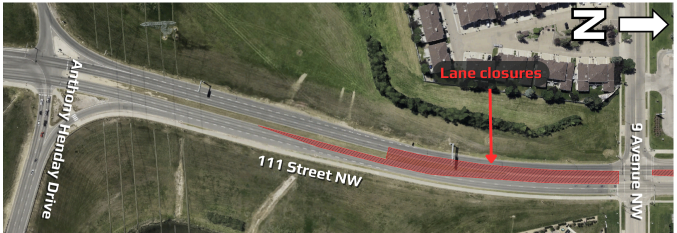
Map 3: Close-up of Phase 1 lane closures on 111 Street between 9 Avenue and Blackmud Creek Bridge