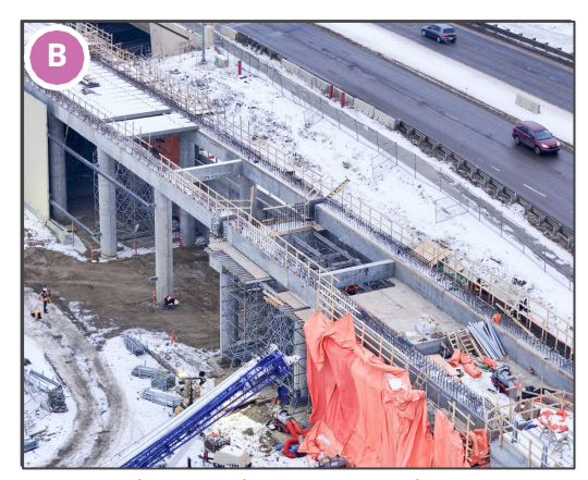
Area 7 - Anthony Henday Drive LRT Bridge Construction