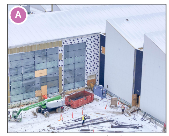
Area 8 - Lewis Farms Storage Facility glazing nearing completion

First LRV is currently undergoing factory testing, with expected completion and shipment in Q2 2025. Seven vehicles are under construction—three in outfitting, three in pre-outfitting, while LRV #2 has completed outfitting and is currently under inspection and bogie trucking process.