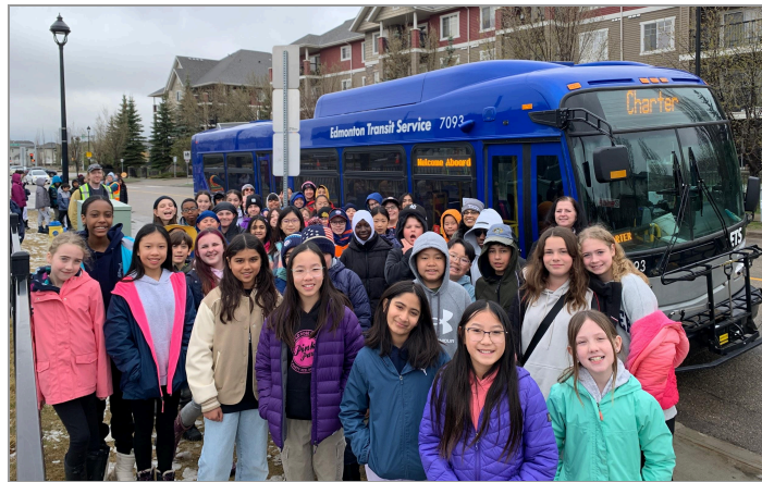
Grade 6 students from Roberta MacAdams School in south Edmonton