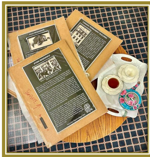
Newly cast historic plaques