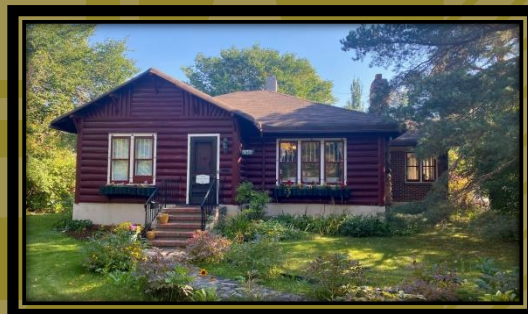
Field Log House