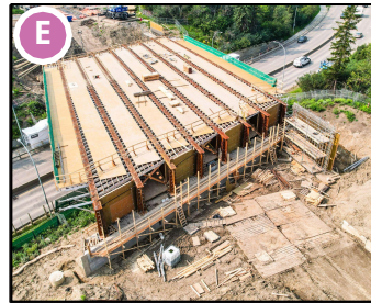
Area 3 - Stony Plain Road Bridge Deck Construction