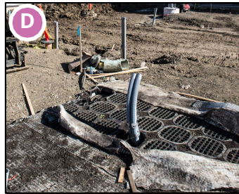
Area 4 - Stony Plain Road & 151 Street Soil Cell Installation