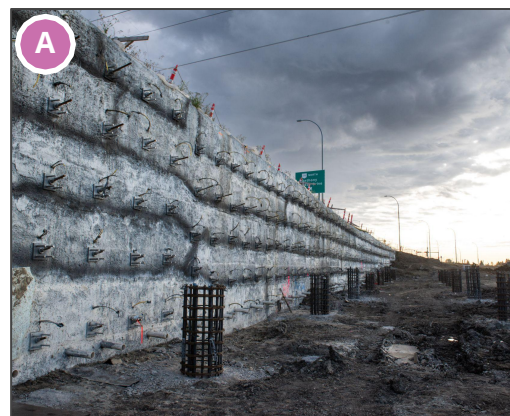
Area 7 - Anthony Henday Drive Bridge Construction

Final design review for the Stage 2 light-rail vehicle (LRV) commenced in May 2023 and continued throughout Q3. Review will continue into 2024.