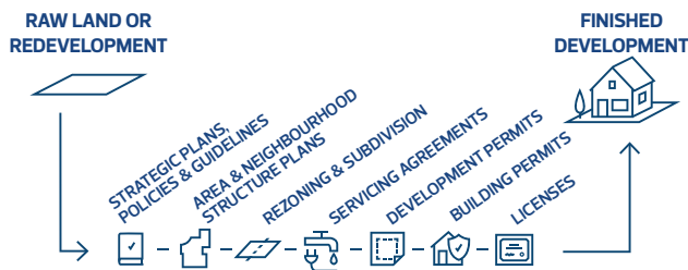
Figure 1. Land Development Process

Tracking and reporting lot servicing aids in assessing the volume of residential development within the developing area of the city over time. Based on the Land Development Process (Figure 1), this stage occurs between lot subdivision and building permits.