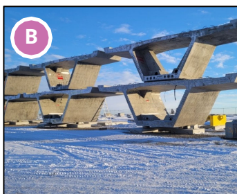
Area 6 - Elevated Guideway Segmented Girders