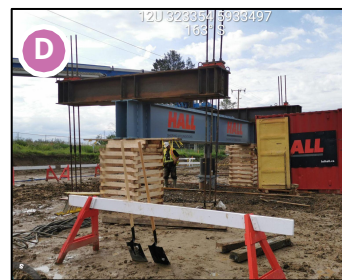
Area 9 - CFA Pile Testing at Gerry Wright OMF-B