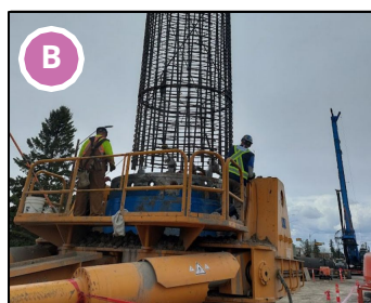
Area 6 - Elevated Guideway Pier Caisson Installation