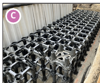
Area 4 - Soil Cell Installation on 153 Street