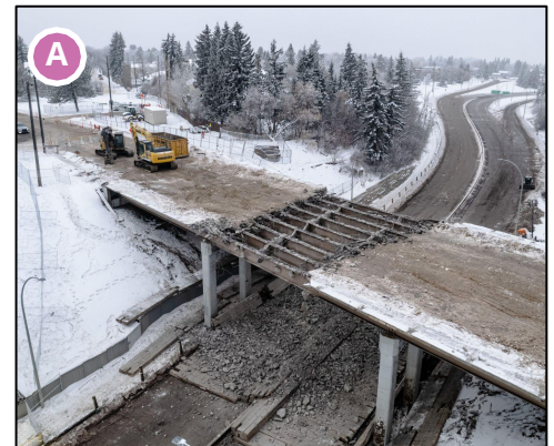
Area 3 - Stony Plain Road Bridge Demolition

During this quarter, submittal reviews for the Preliminary Design Review were ongoing. In October, HRC visited Edmonton to participate in integration meetings with the City and MIP. Members of the City team visited South Korea in December for preliminary design review (PDR) technical workshops and to view the LRV mock-up and provide initial comments.