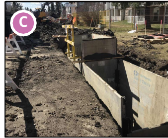
Area 5 - Sanitary sewer line installation