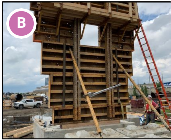
Area 6 - Formwork for pier mock-up