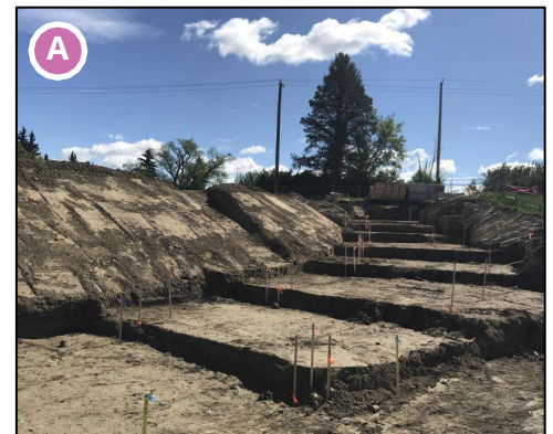
Area 8 - Retaining wall construction at Lewis Farms

HRC continued LRV (Light Rail Vehicle) design work, with Conceptual Design Review - an early stage of design used in manufacturing to gain alignment on key functionality questions - completed in mid-June. In May, technical team members held meetings in Korea to take part in Conceptual Design Review workshops.