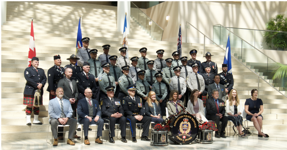
Community Peace Officer graduates with dignitaries, City Hall, Edmonton, July 12, 2022

The nine new Transit Peace Officers (TPOs) increase the total number of TPOs to approximately 90, contributing to a more visible presence within the transit system. Additionally, other TPOs will be shifted from other roles to have seven Community Outreach Transit Teams by the end of the summer.