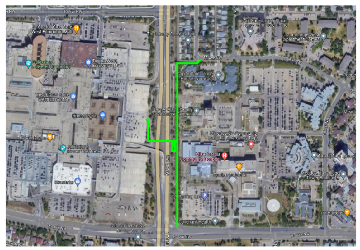
Image 2 - Shared pathway and 170 Street Pedestrian Bridge. Green indicates permanent access once the bridge is open.

For information about this project, contact: